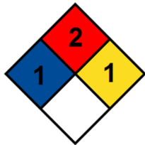
HMIS Color Bar